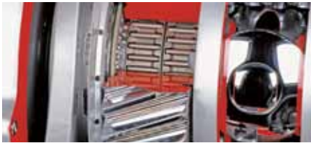
The oil deflector ensures full lubrication of the power divider at very low vehicle speeds. Therefore, a costly oil pump is not necessary.