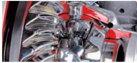
The differential case is half integrated in the ground wheel. Elimination of a pinion head bearing allows the use of a larger differential.